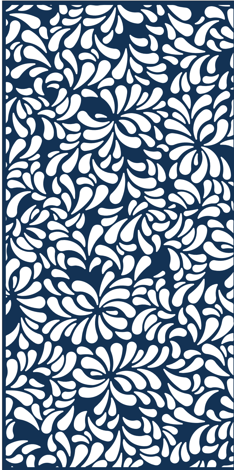
Sheet sample 1000 × 2000 mm at 1:10 scale.